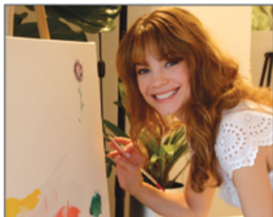
Rebecca Herbst, actor on the daytime drama series "General Hospital," participates in the event.

Fifty of over 2,000 paintings created by cancer survivors from around the world for Lilly Oncology on Canvas International Art Competition and Exhibition went on display in June 2007 at Pacific Shores Medical Group's Long Beach and Glendale offices.